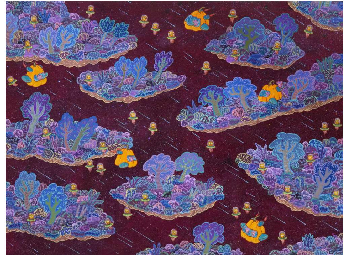
Rewriting the Stars 91 x 121cm | Acrylic on Canvas | 2025

In Rewriting The Stars , the artist reimagines timeless proverbs through a cosmic adventure. A civilization of intelligent frog aliens shatters the “katak di bawah tempurung” stereotype, while a brilliant mouse engineer redefines “bagai tikus memperbaiki labu” by turning a pumpkin into an interstellar spaceship. This painting celebrates curiosity, innovation and the idea that even the humblest creatures can transcend limitations and reach for the stars.