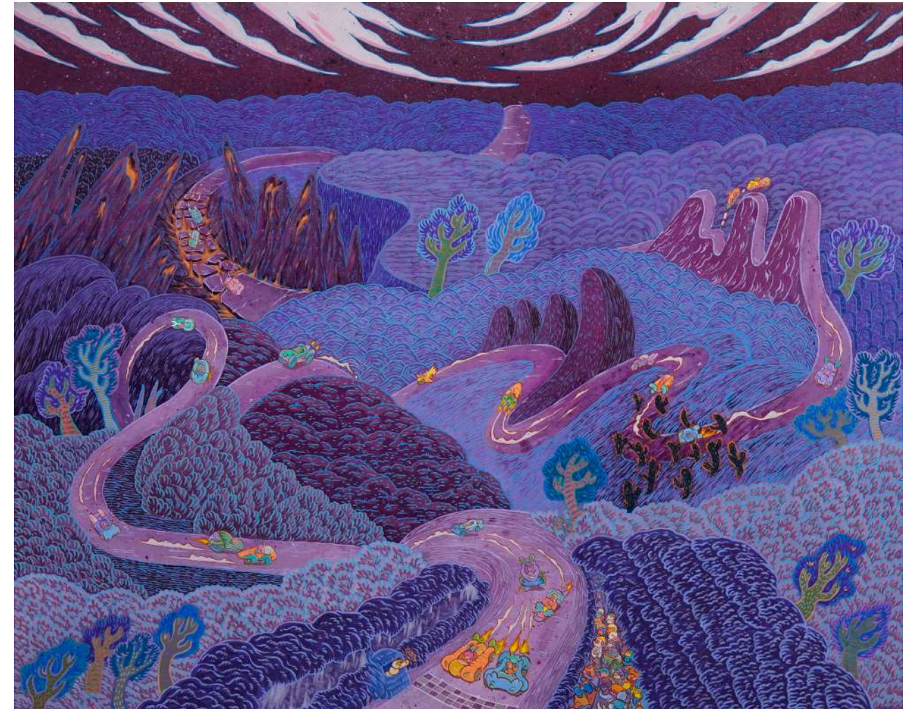
Fast & Fearless 121 x 152cm | Acrylic on Canvas | 2025

In Fast & Fearless , the artist reimagines the legendary race between the rabbit and the tortoise as a fierce competition on a high-tech track. No longer about patience, success now depends on ambition, adaptation and innovation—proving that in this race, the finish line is anyone's game.