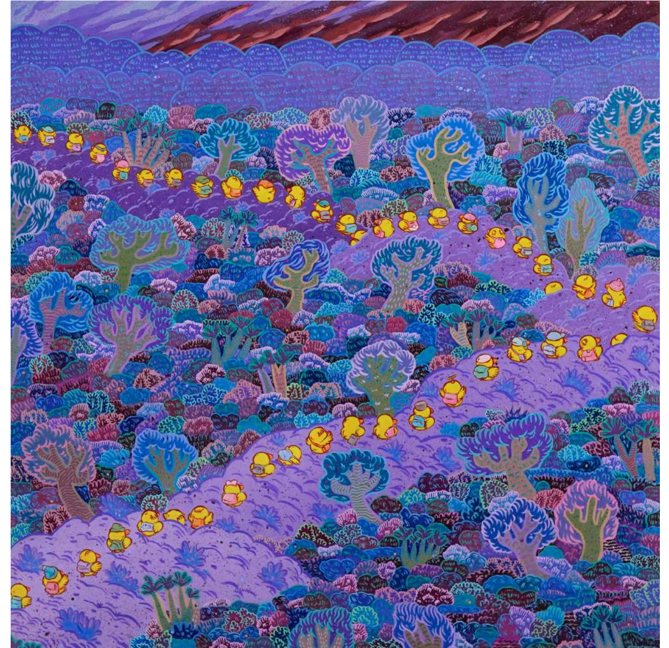
Golden Hour Journey 91 x 91cm | Acrylic on Canvas | 2025

In Golden Hour Journey, the artist redefines “bagai itik pulang petang”, which describes slow and sluggish movement. Here, the ducks are not lagging behind but walking with purpose, savouring the journey. Each hill symbolizes patience and resilience, reminding us that moving at our own pace can lead to the most meaningful experiences.