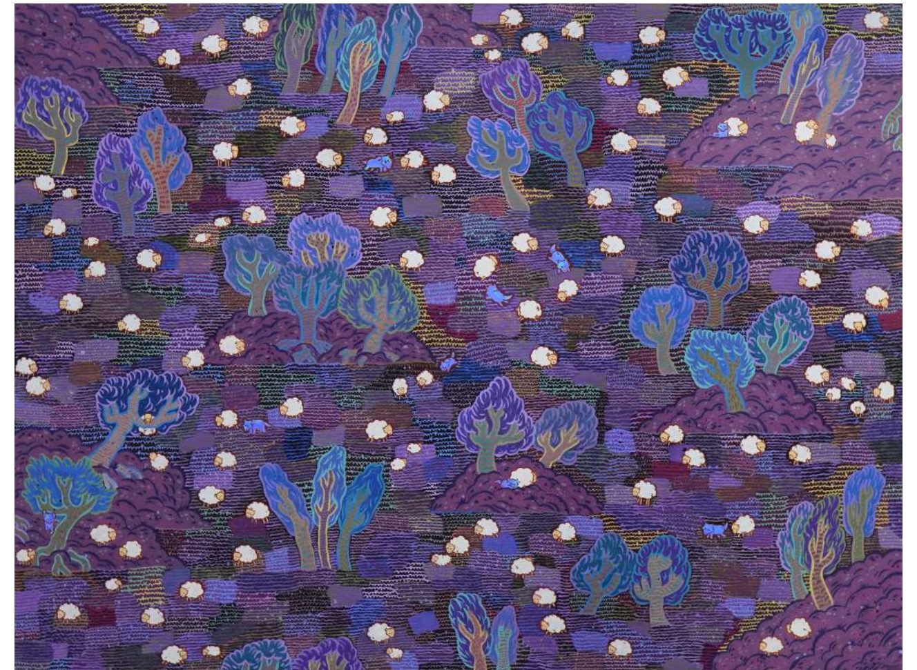
The Fleece & The Fangs 91 x 121cm | Acrylic on Canvas | 2025

In The Fleece & The Fangs , the artist reimagines an old cautionary tale, turning rivalry into friendship. In a peaceful sheep farm, wolves roam freely, not as threats but as companions. Challenging the idea of endless rivalry, this painting celebrates unlikely bonds, showing that understanding can overcome divides—sometimes, those we once feared become our greatest allies.