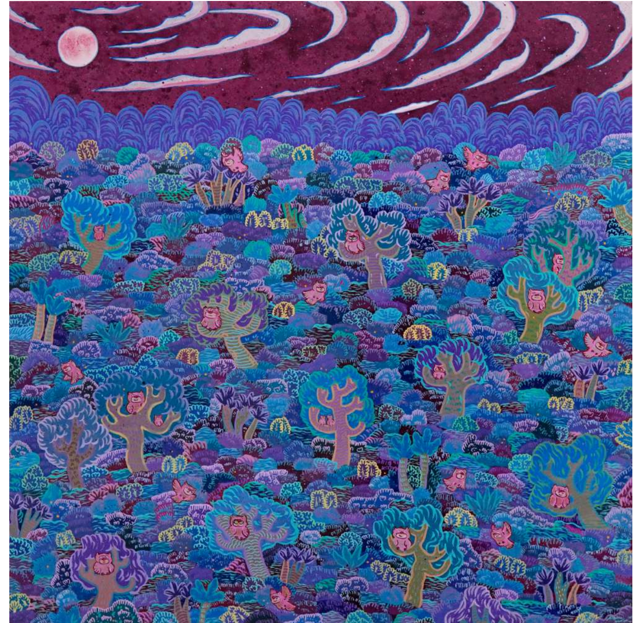
The Moonlit Dreams 91 x 91cm | Acrylic on Canvas | 2025

Inspired by the Malay proverb “bagai pungguk rindukan bulan”, which speaks of yearning for the unattainable, The Moonlit Dreams reimagines this longing. Under a glowing moon, owls no longer yearn hopelessly—they soar toward it, embracing their connection. This painting challenges fate, proving that with courage, the unattainable is merely a flight away. Dreams await those bold enough to pursue them.