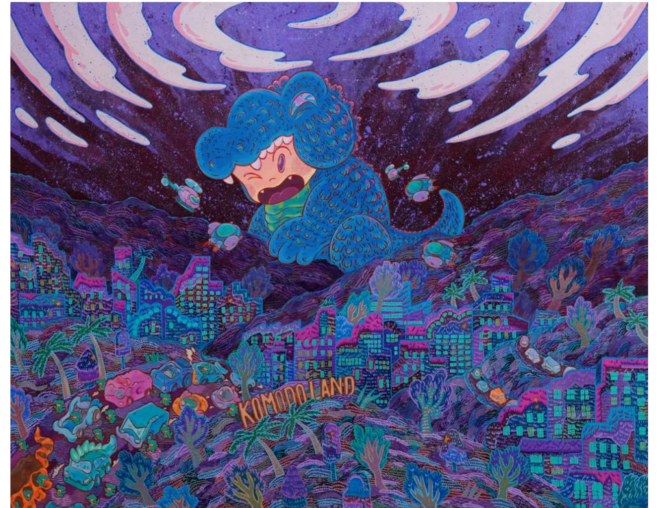
Komodozilla: Hero or Villain? 121 x 152cm | Acrylic on Canvas | 2025

The artist reimagines the Malay proverb “Malang Pak Kaduk, ayamnya menang kampung tergadai,” which means a fleeting victory can bring great loss. Through the tale of a carefree Komodo lizard who takes one innocent bite of a magical fruit and transforms into the colossal Komodozilla, he illustrates how joy can turn to devastation. Hero or Villain? This work reflects how small actions can lead to irreversible consequences.