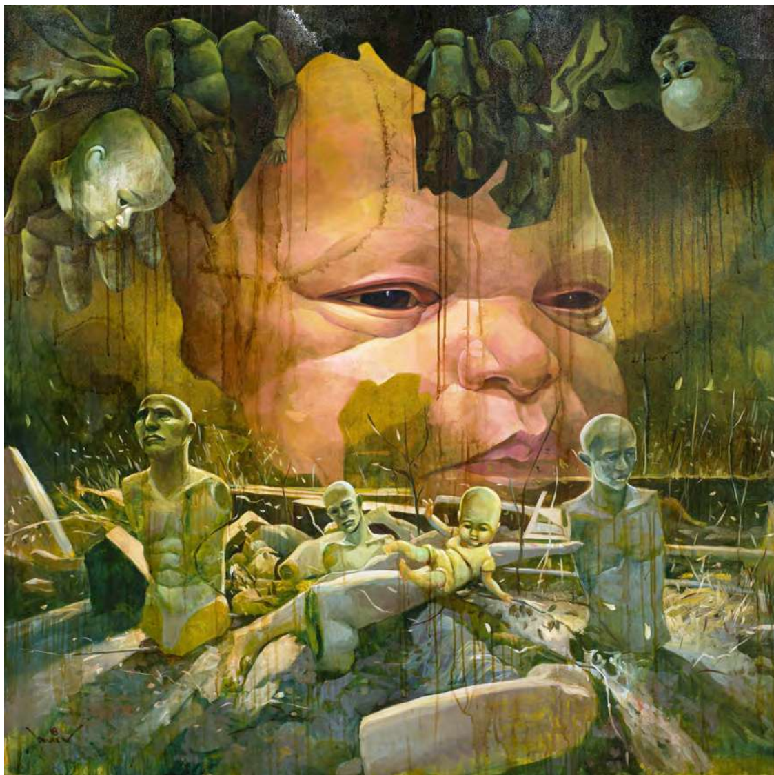
Disenchantment of hope. Fallen Star 122 x 122 cm Oil on canvas 2018