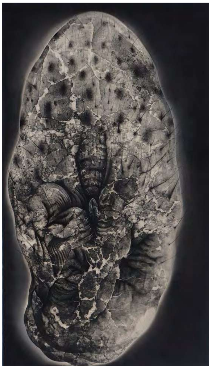
Unknown Species II

200 x 115 cm Oil and charcoal on canvas 2017