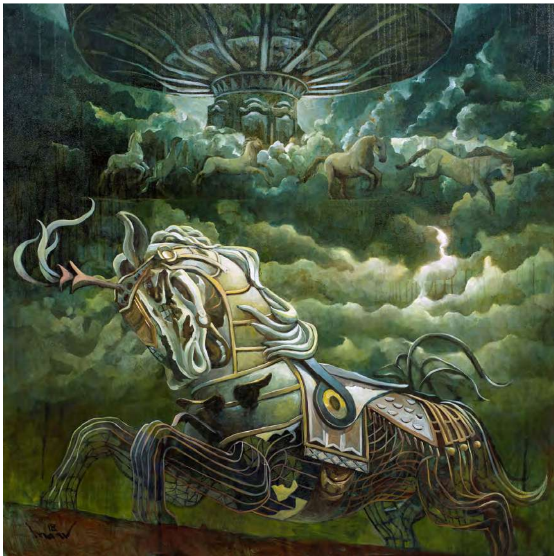
Disenchantment of hope. The day, the carousel stopped