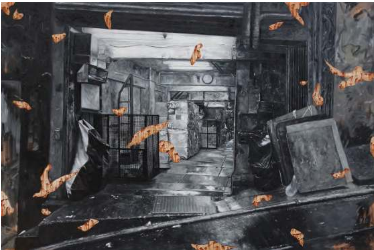
Portal 121.5 x 182.5 cm | Oil on canvas | 2017