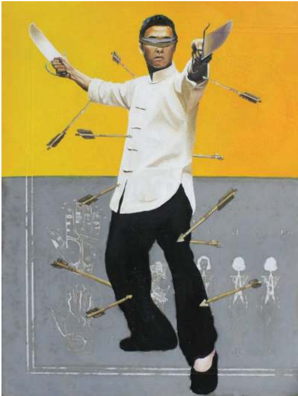
Fighter 1 80 x 60 cm | Oil on etched aluminium | 2018