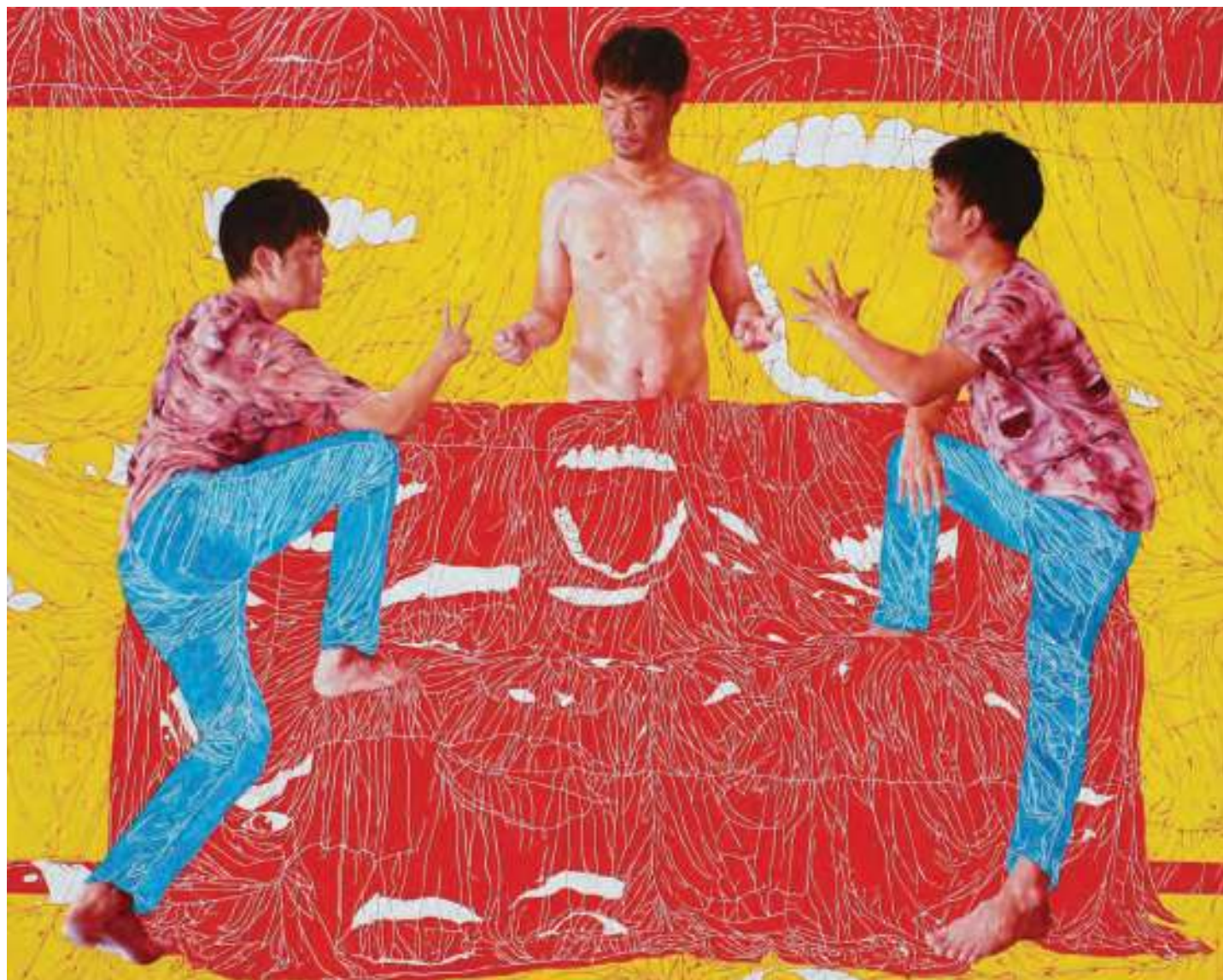
I win myself