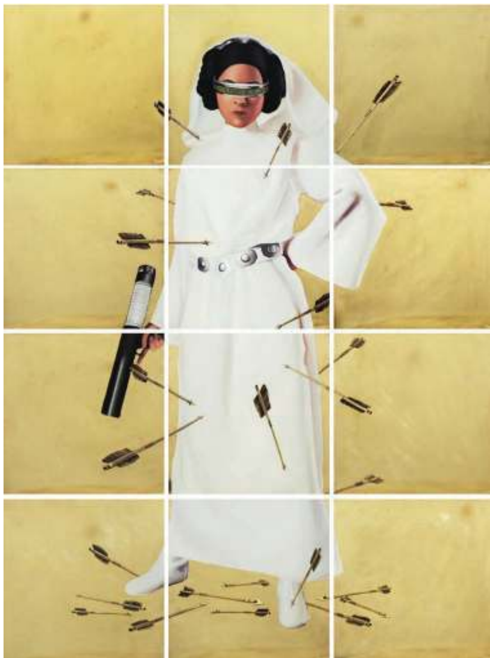
Fighter 3 200 x 150 cm ( 12 Panel ) | Oil on brass | 2018