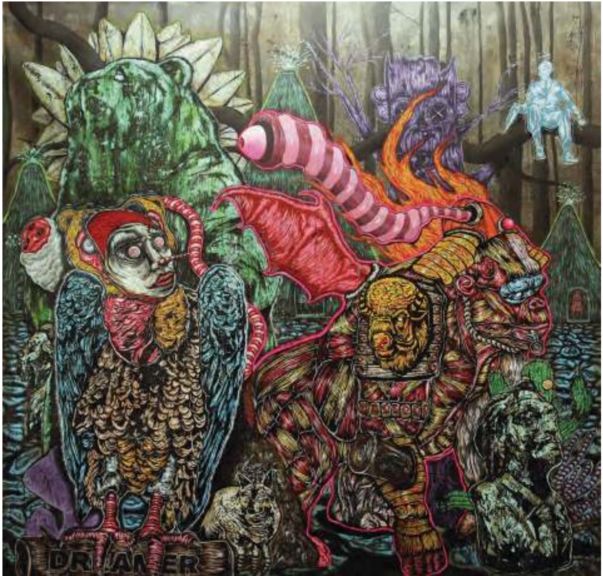
The Tale of The Dreamer & The Injured Fighter 198 x 206 cm | Oil & acrylic on jute | 2018