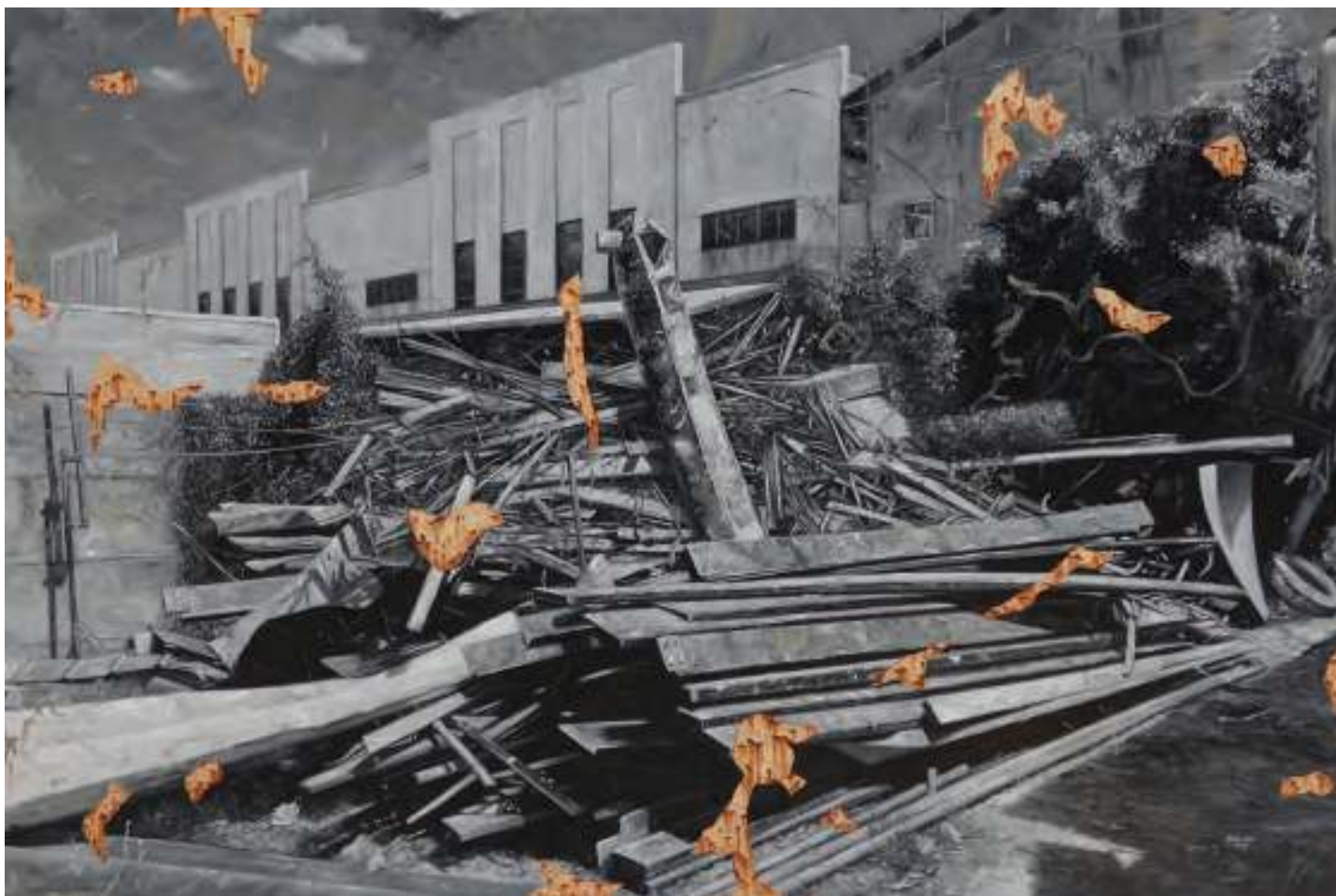
Totem 121.5 x 182.5 cm | Oil on canvas | 2017