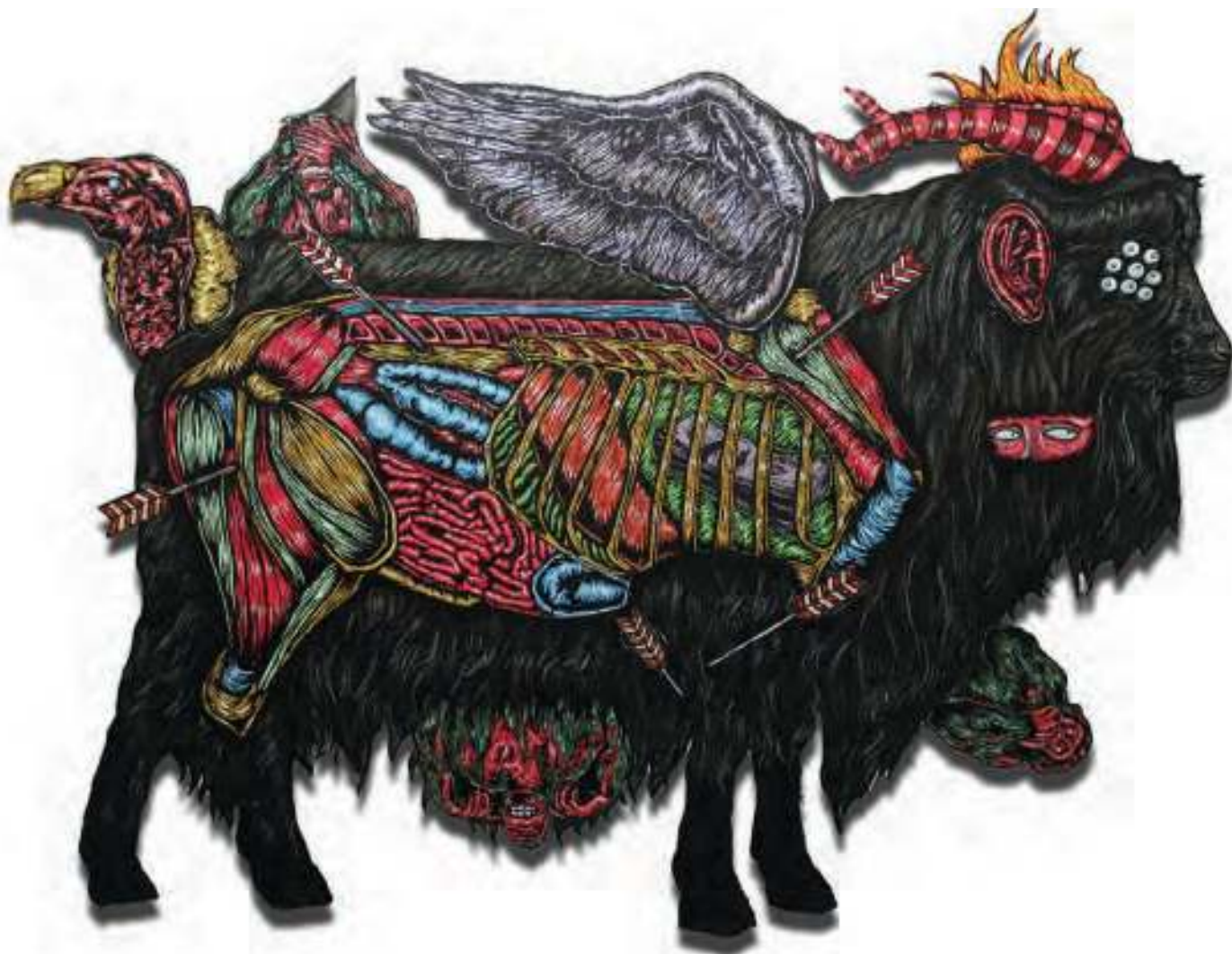
The Black Goat Who Defended His Master 159x202cm | Oil & acrylic on jute stick on mdf board | 2018