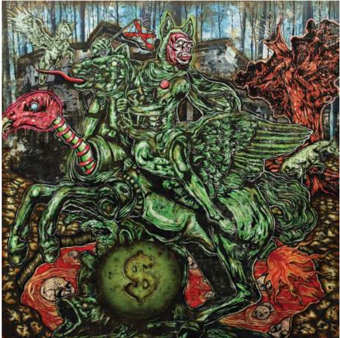
The Warrior of The Broken Empire 153 x 153 cm | Oil & acrylic on jute | 2018