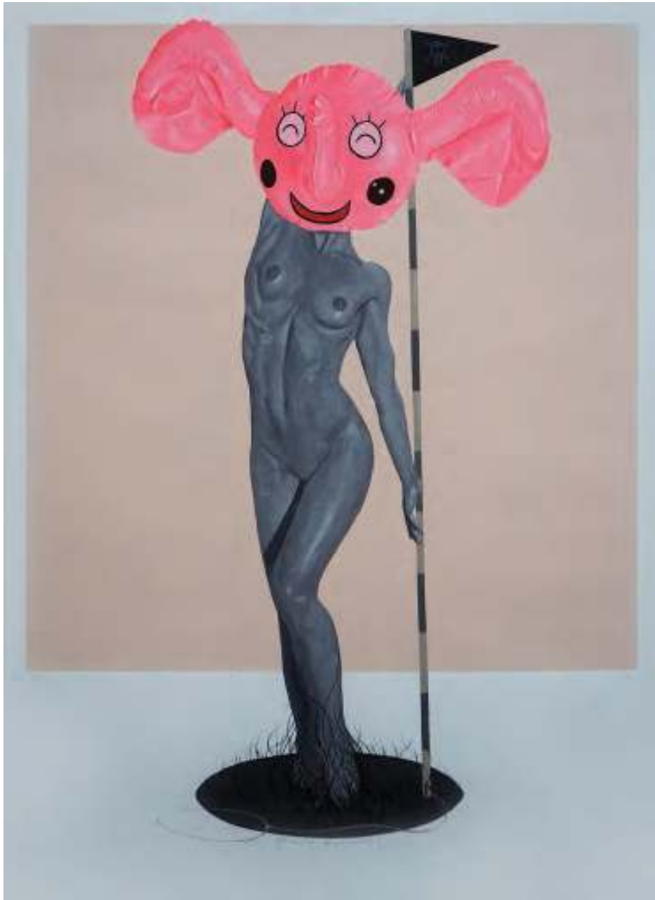
Pink Trap on Track 77 x 56 cm | Acrylic on paper | 2018