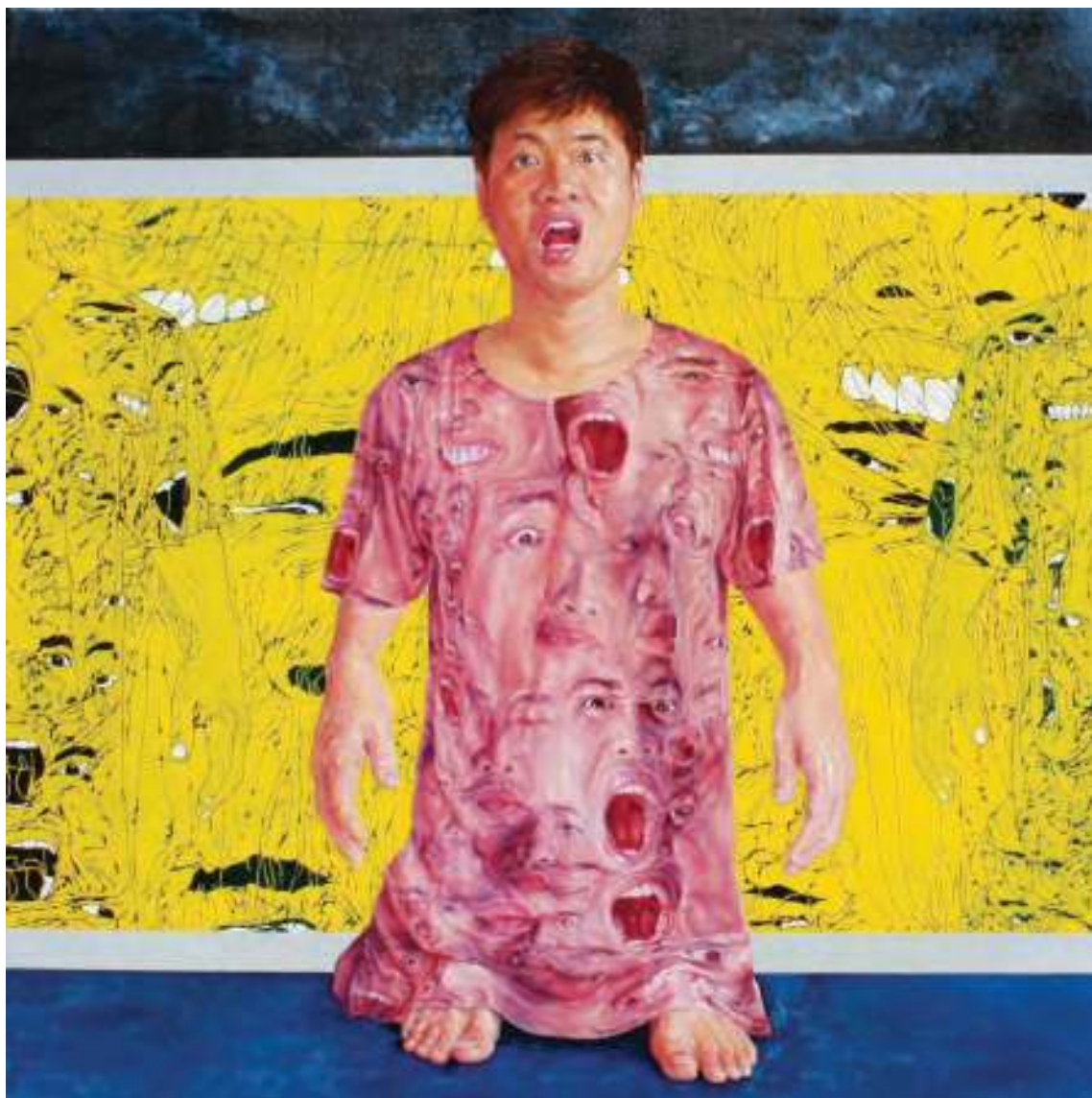
My fake pathetic self 100 x 100 cm | Oil on canvas | 2017