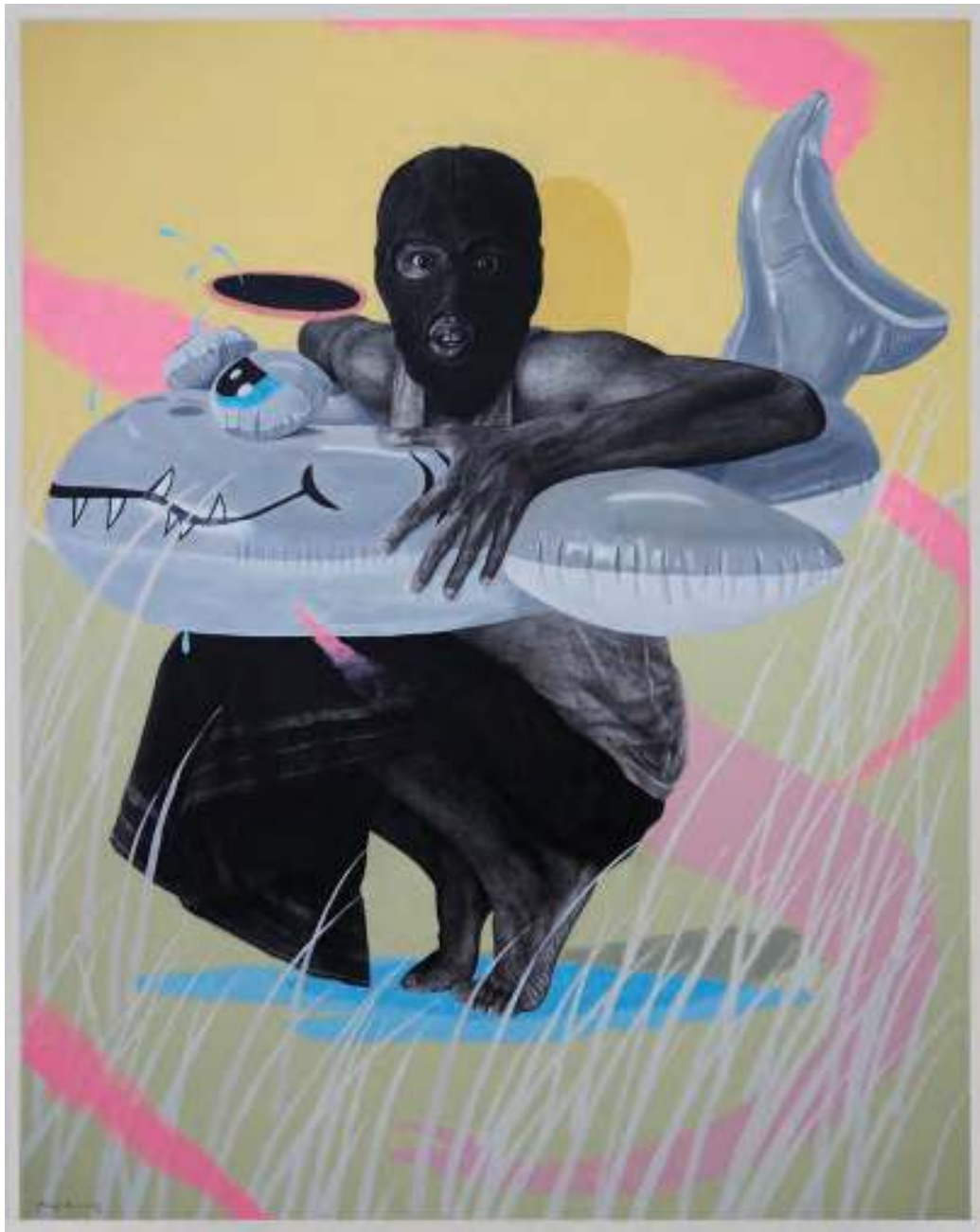
SORRY !! I I'm Not A Pirate 170 x 135 cm | Charcoal, acrylic & oil on canvas | 2017