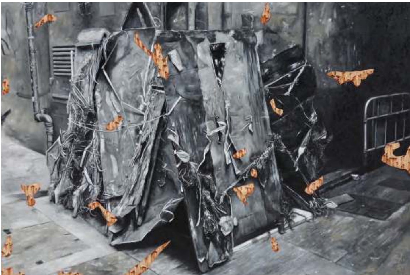
The Altar 121.5 x 182.5 cm | Oil on canvas | 2017