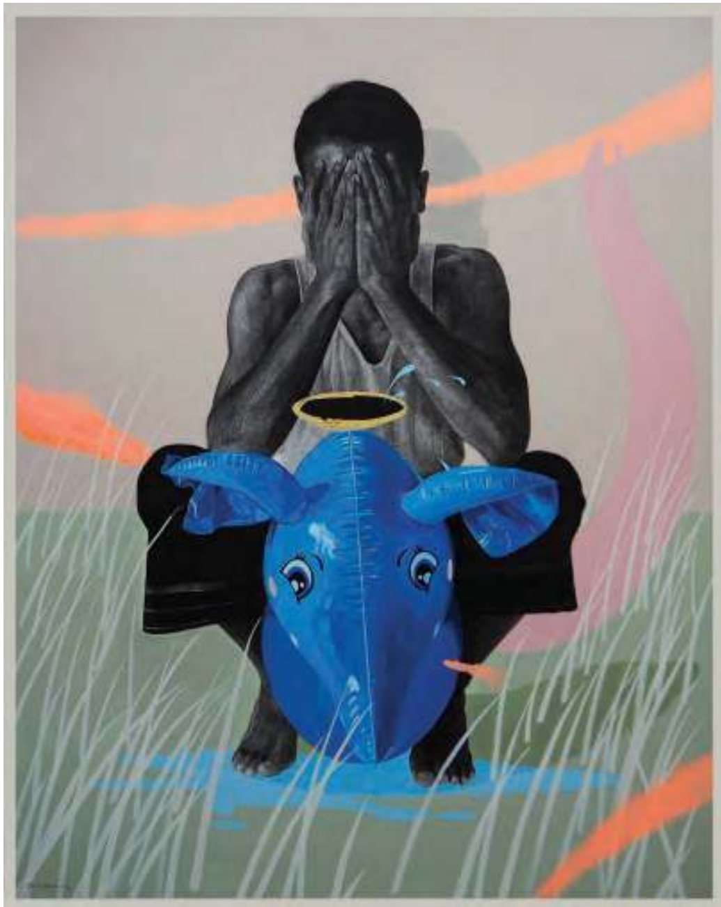
SORRY !! 2 This is Not What You Imagine

170 x 135 cm | Charcoal, acrylic & oil on canvas | 2017