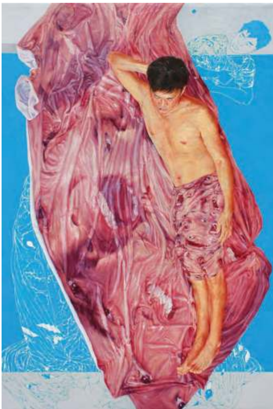
I belong to me 150 x 100 cm | Oil on canvas | 2017