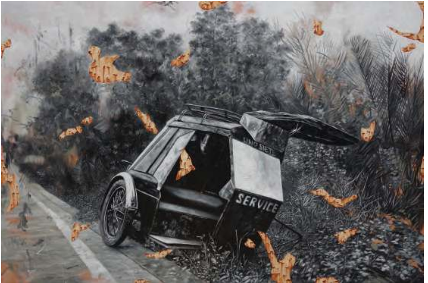
Hiatus 121.5 x 182.5 cm | Oil on canvas | 2017