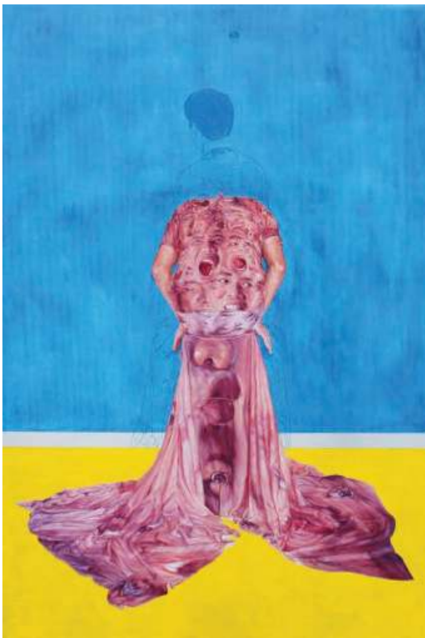
I know who I am 150 x 100 cm | Oil on canvas | 2017