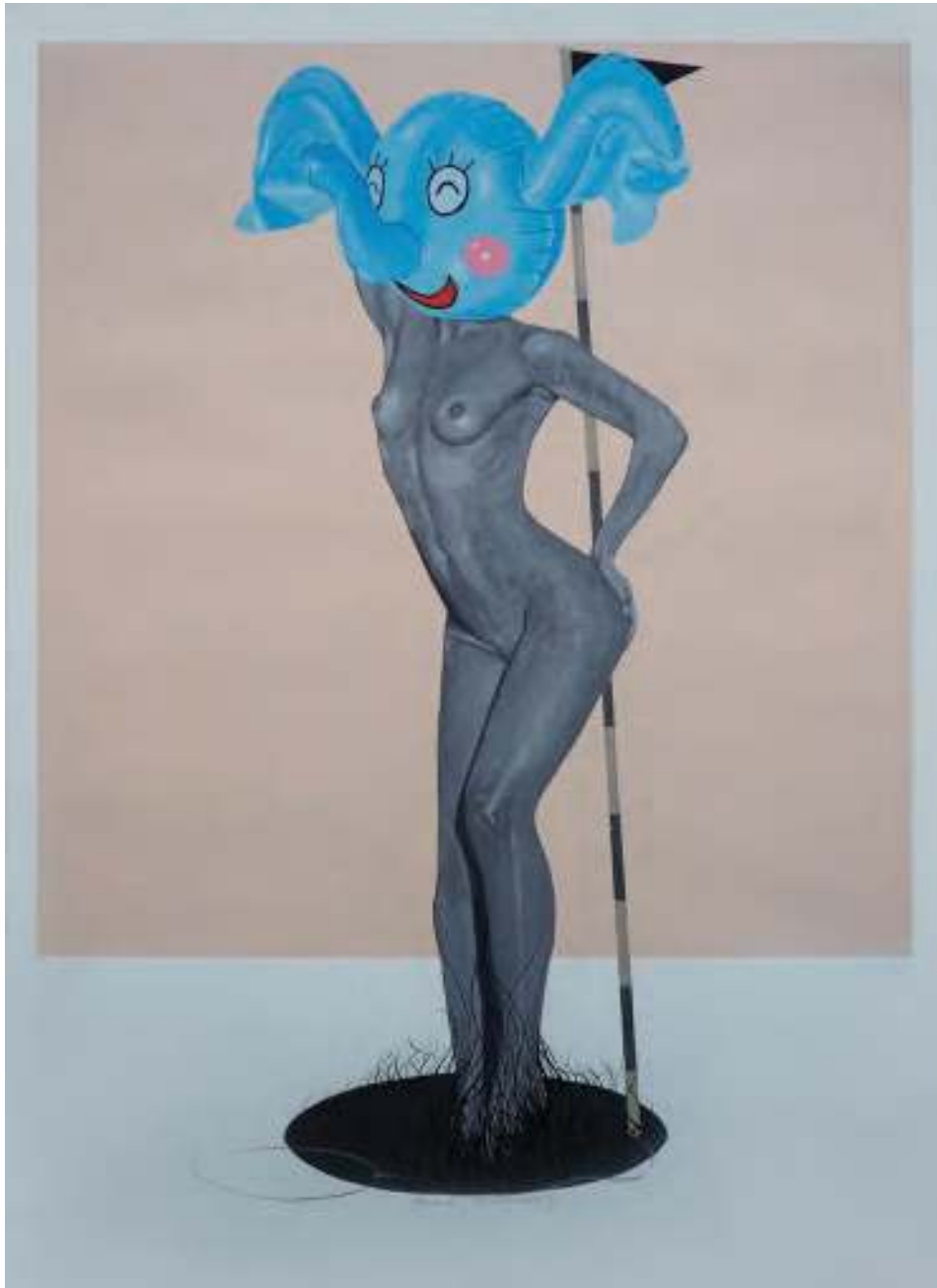
Blue Trap on Track 77 x 56 cm | Acrylic on paper | 2018