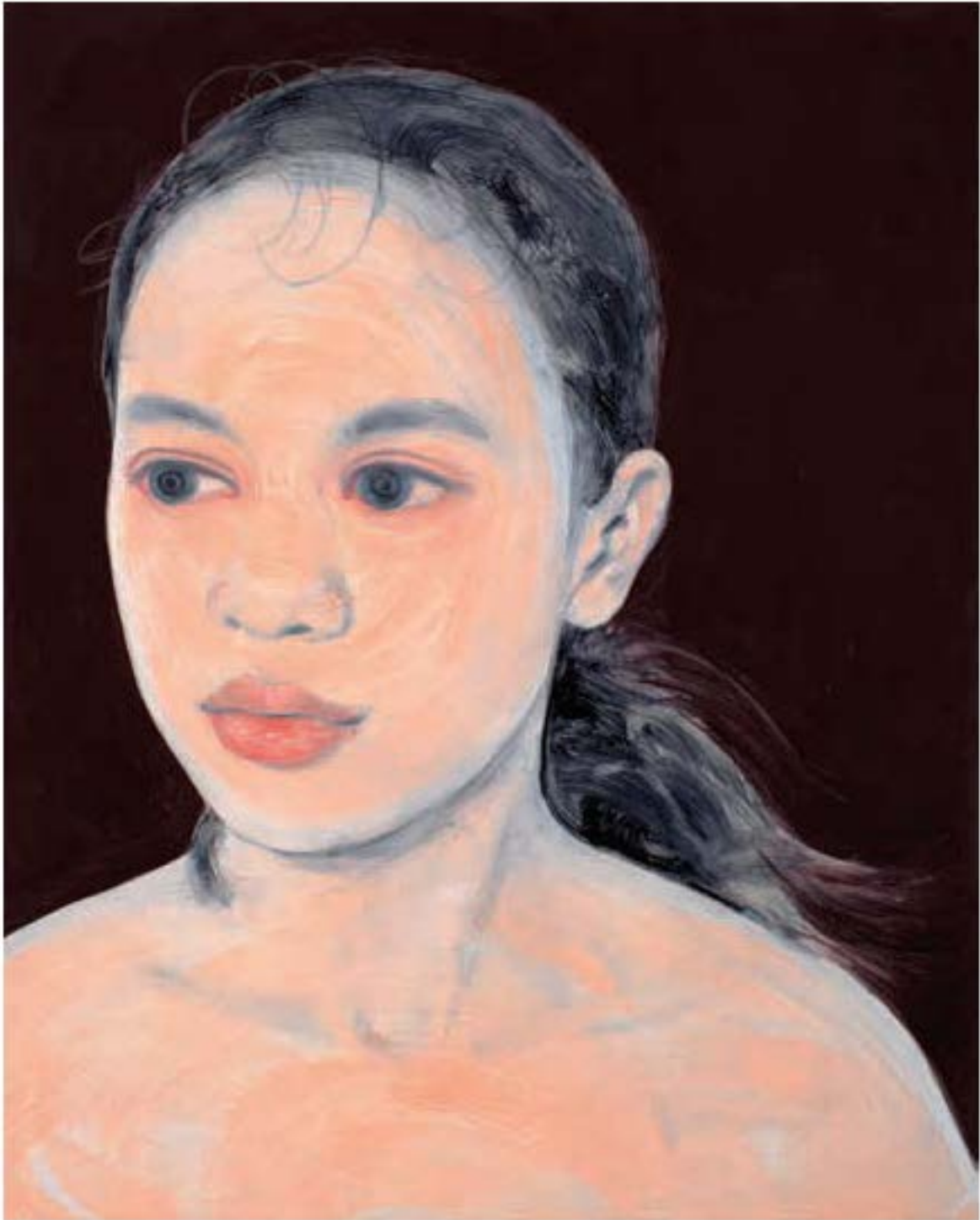
馬來亞 - 夜譚之1009 MALAYAN NIGHTS 1009 76.2 x 61 cm | Oil and Acrylic on Canvas | 2017