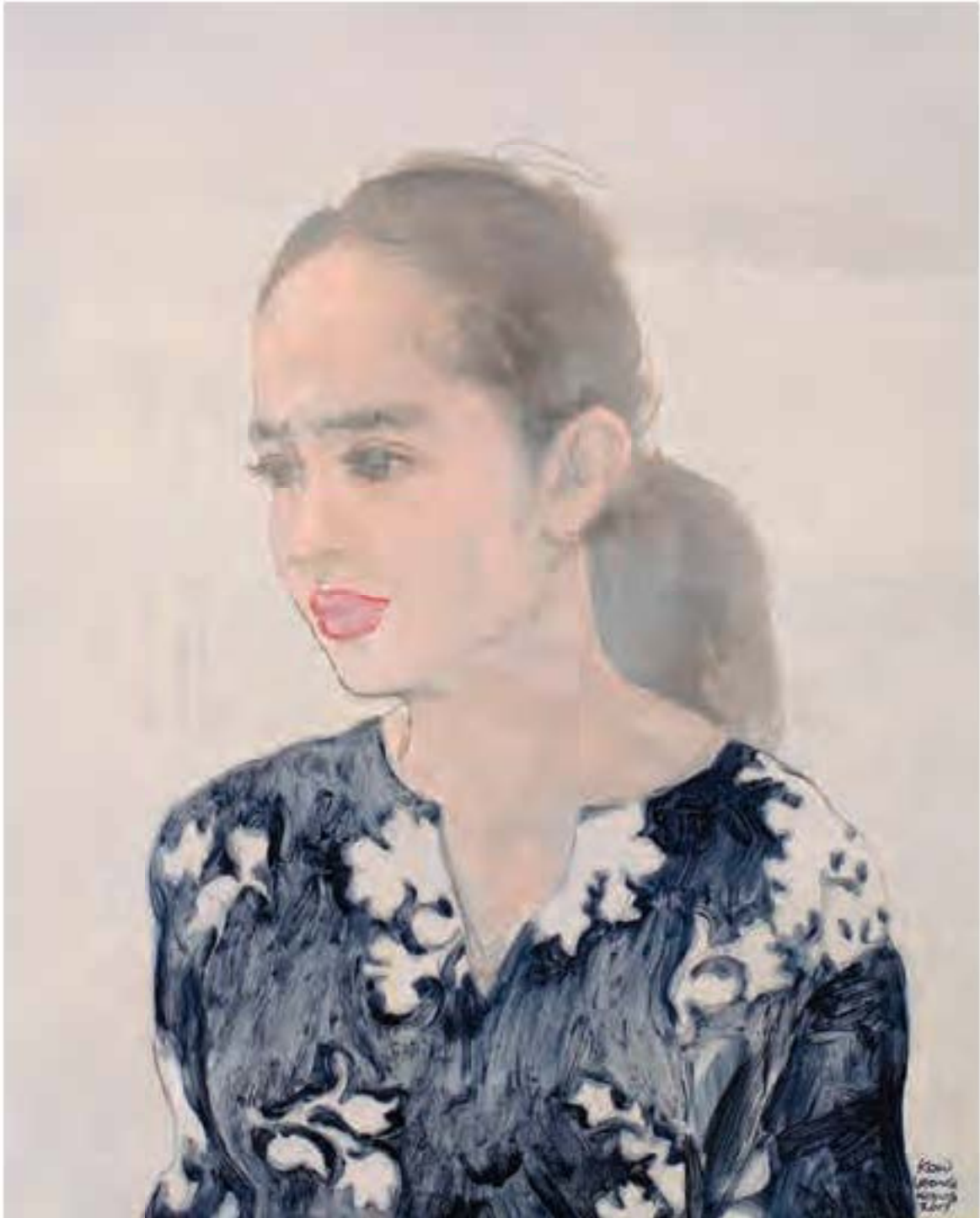
馬來亞 - 夜譚之1001 MALAYAN NIGHTS 1001 76.2 x 61 cm | Oil and Acrylic on Canvas | 2017