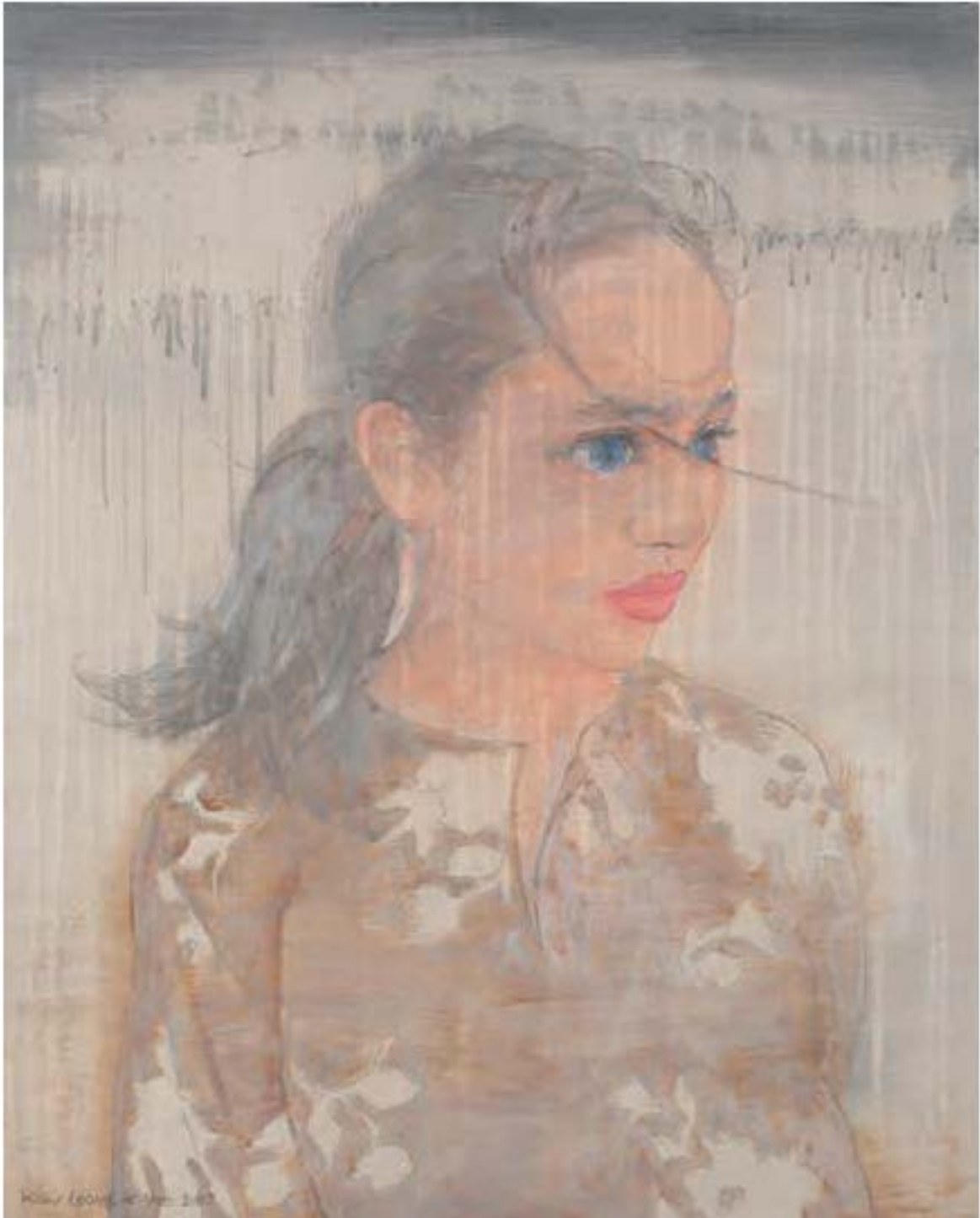
馬來亞 - 夜譚之1002 MALAYAN NIGHTS 1002 76.2 x 61 cm | Oil and Acrylic on Canvas | 2017