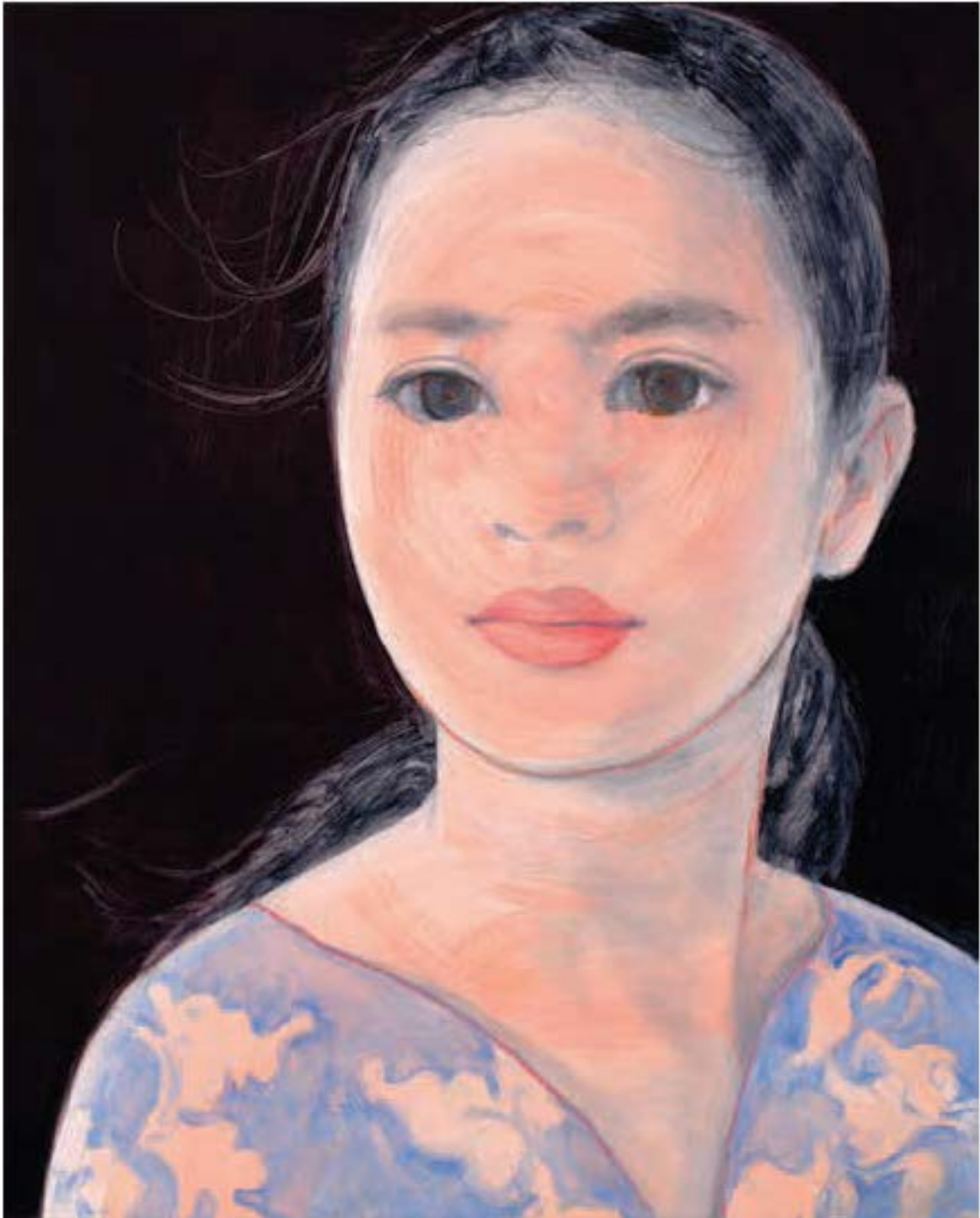
馬來亞 - 夜譚之1008 MALAYAN NIGHTS 1008 76.2 x 61 cm | Oil and Acrylic on Canvas | 2017