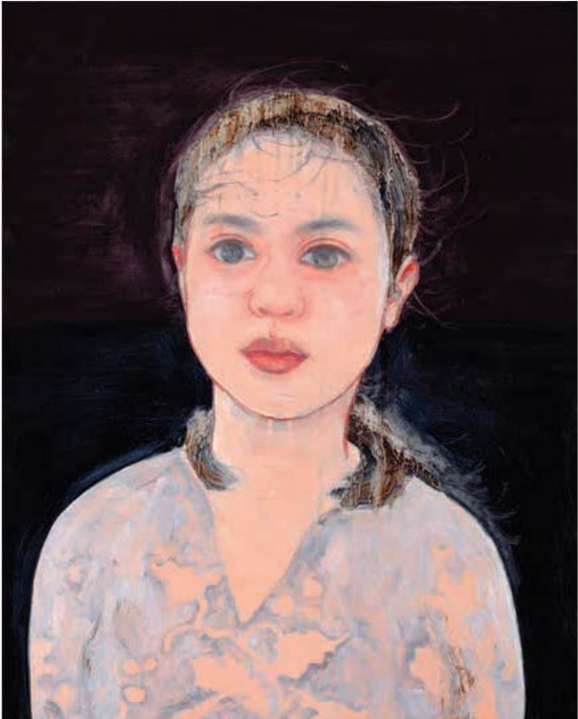
馬來亞 - 夜譚之1006 MALAYAN NIGHTS 1006 76.2 x 61 cm | Oil and Acrylic on Canvas | 2017