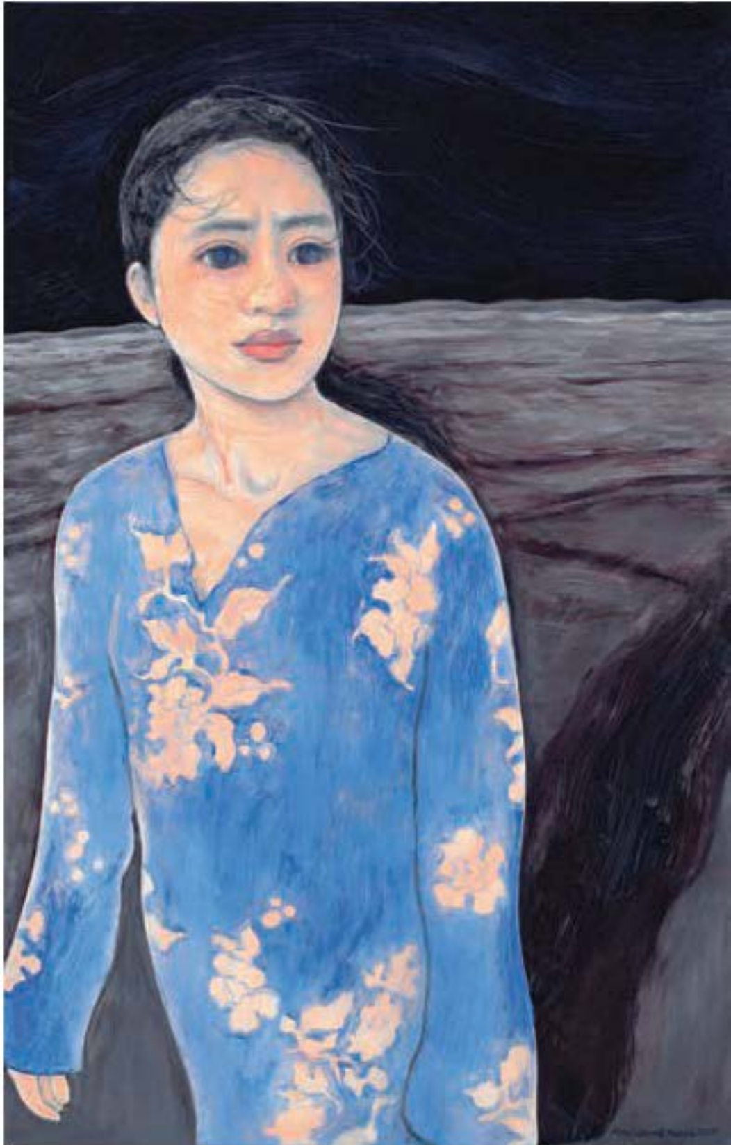
馬來亞 - 夜譚之1010 MALAYAN NIGHTS 1010 142 x 90 cm | Oil and Acrylic on Canvas | 2017