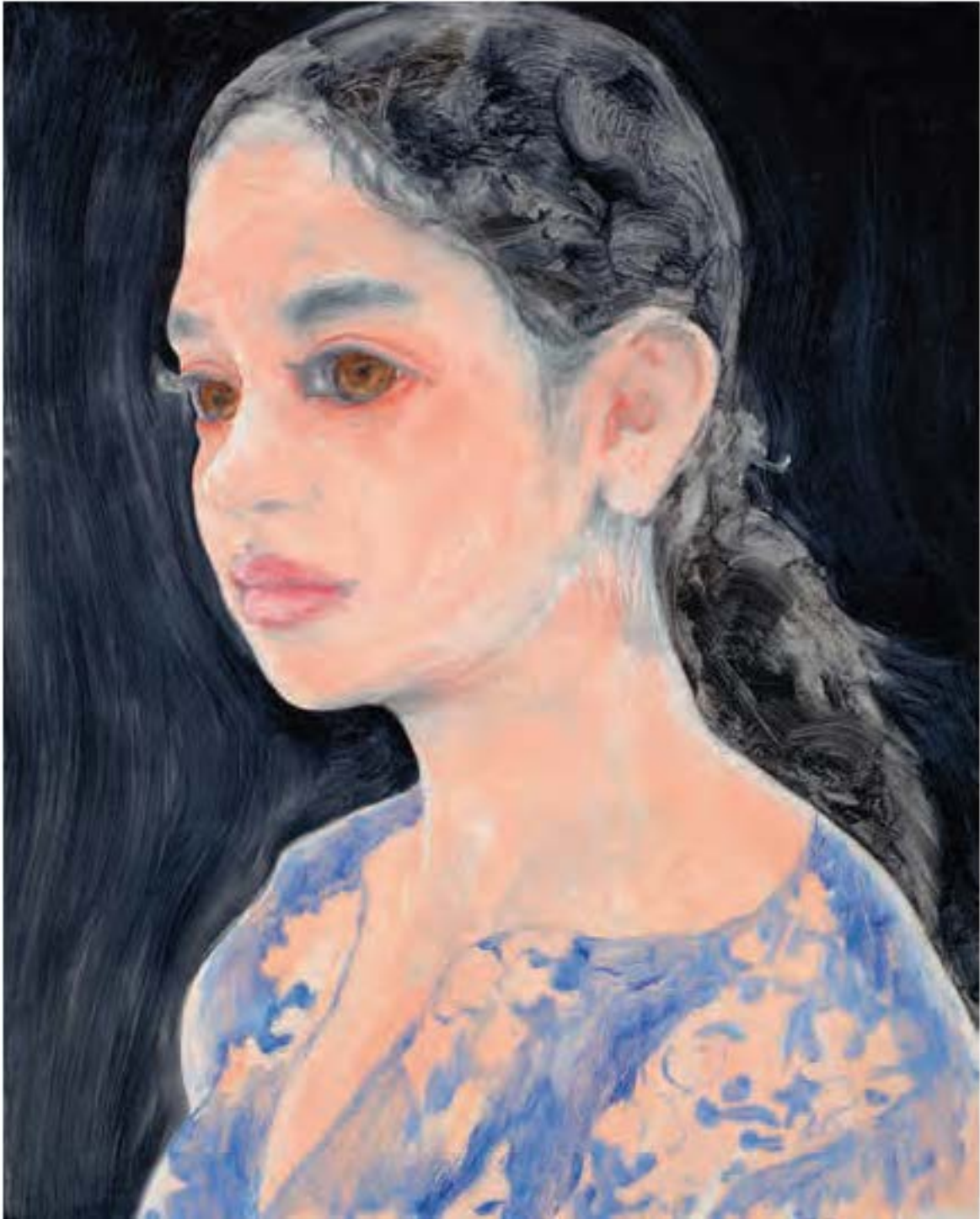
馬來亞 - 夜譚之1005 MALAYAN NIGHTS 1005 76.2 x 61 cm | Oil and Acrylic on Canvas | 2017