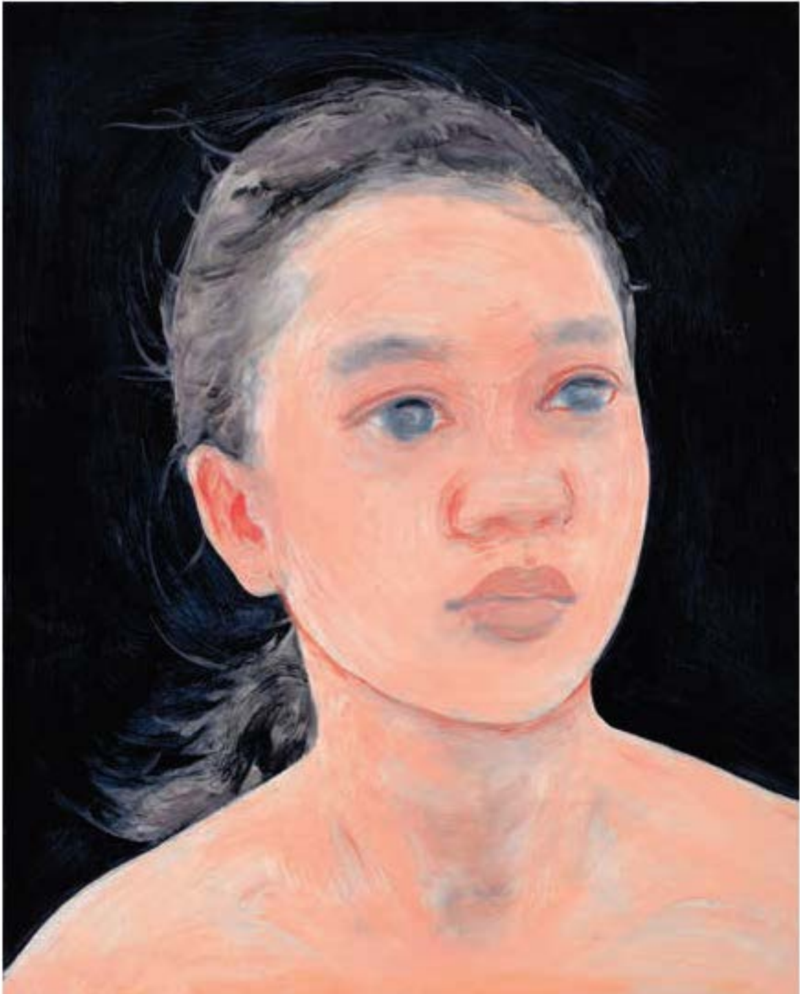
馬來亞 - 夜譚之1004 MALAYAN NIGHTS 1004 76.2 x 61 cm | Oil and Acrylic on Canvas | 2017