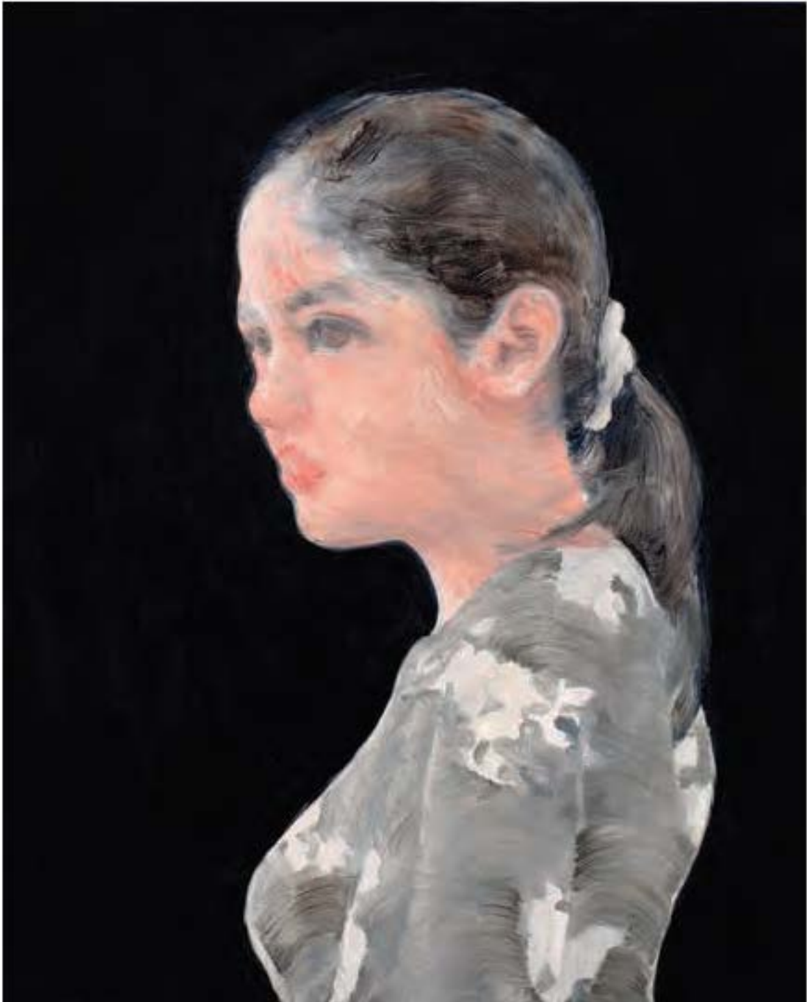
馬來亞 - 夜譚之1003 MALAYAN NIGHTS 1003 76.2 x 61 cm | Oil and Acrylic on Canvas | 2017