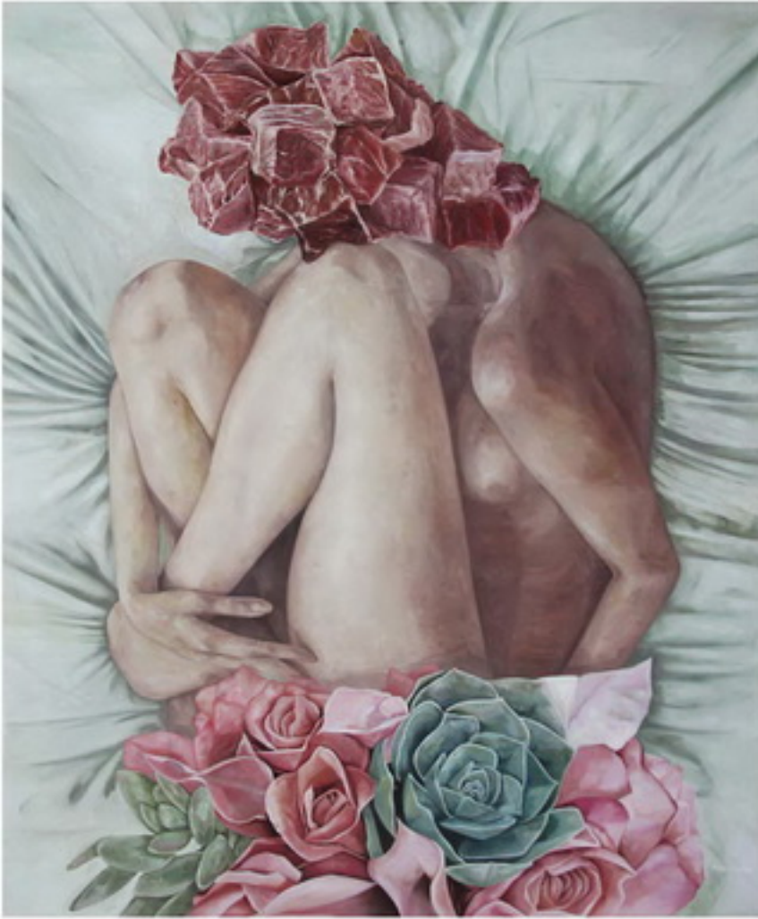
There are ... 180 x 150 cm Oil on Canvas 2016