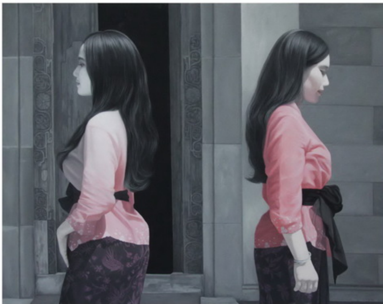
Reflection 130 x 160 cm Oil on Canvas 2016