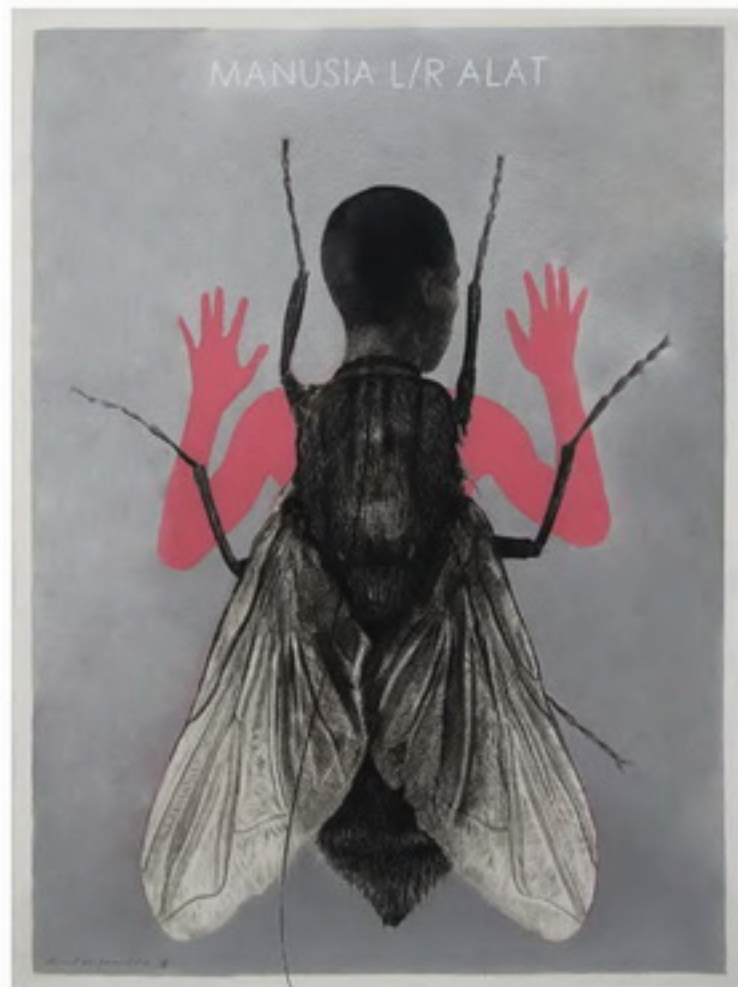
Manusia Lalat I 76.5 x 57 cm Acrylic & Charcoal on Paper 2016