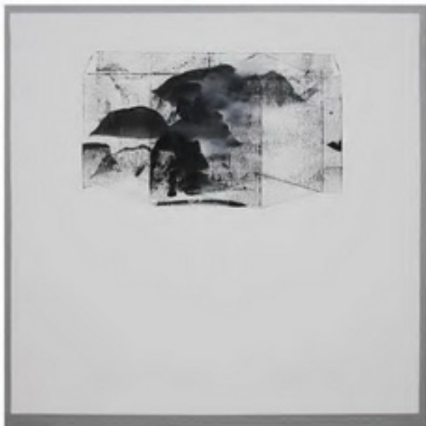
Kintamani 61 x 61 cm Oil on Canvas 2016