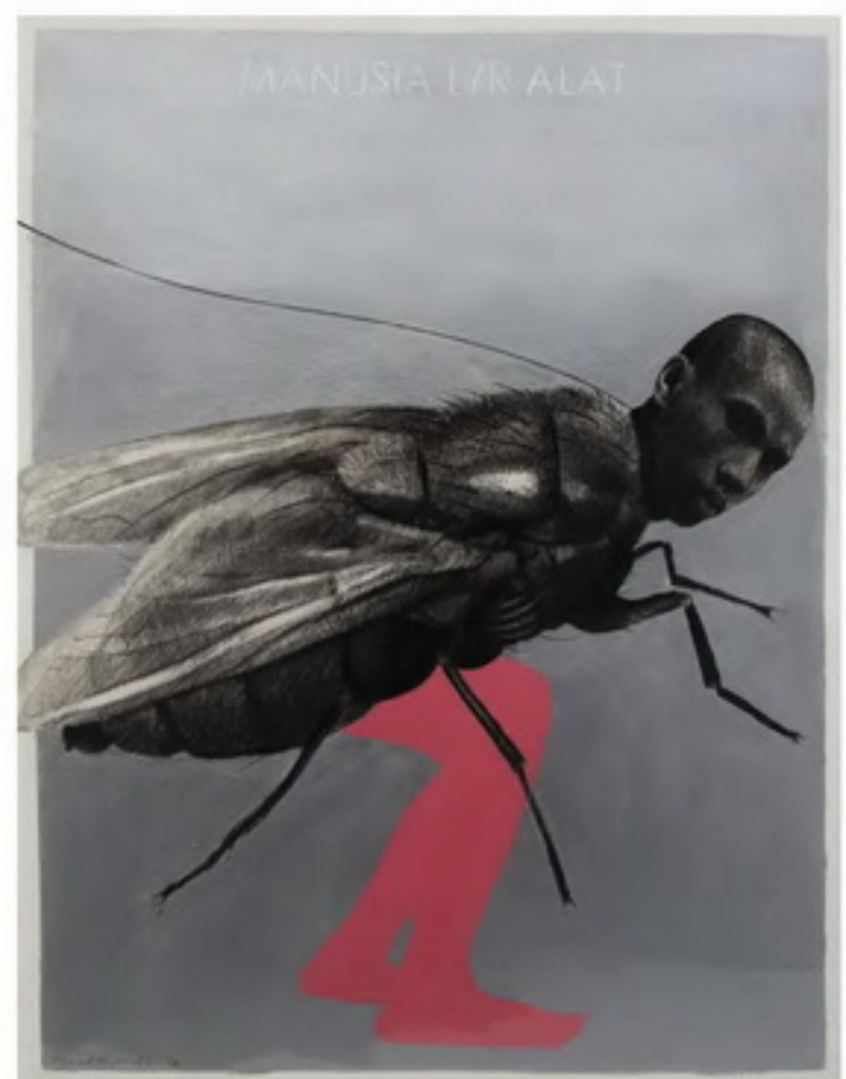
Manusia Lalat II 76.5 x 57 cm Acrylic & Charcoal on Paper 2016