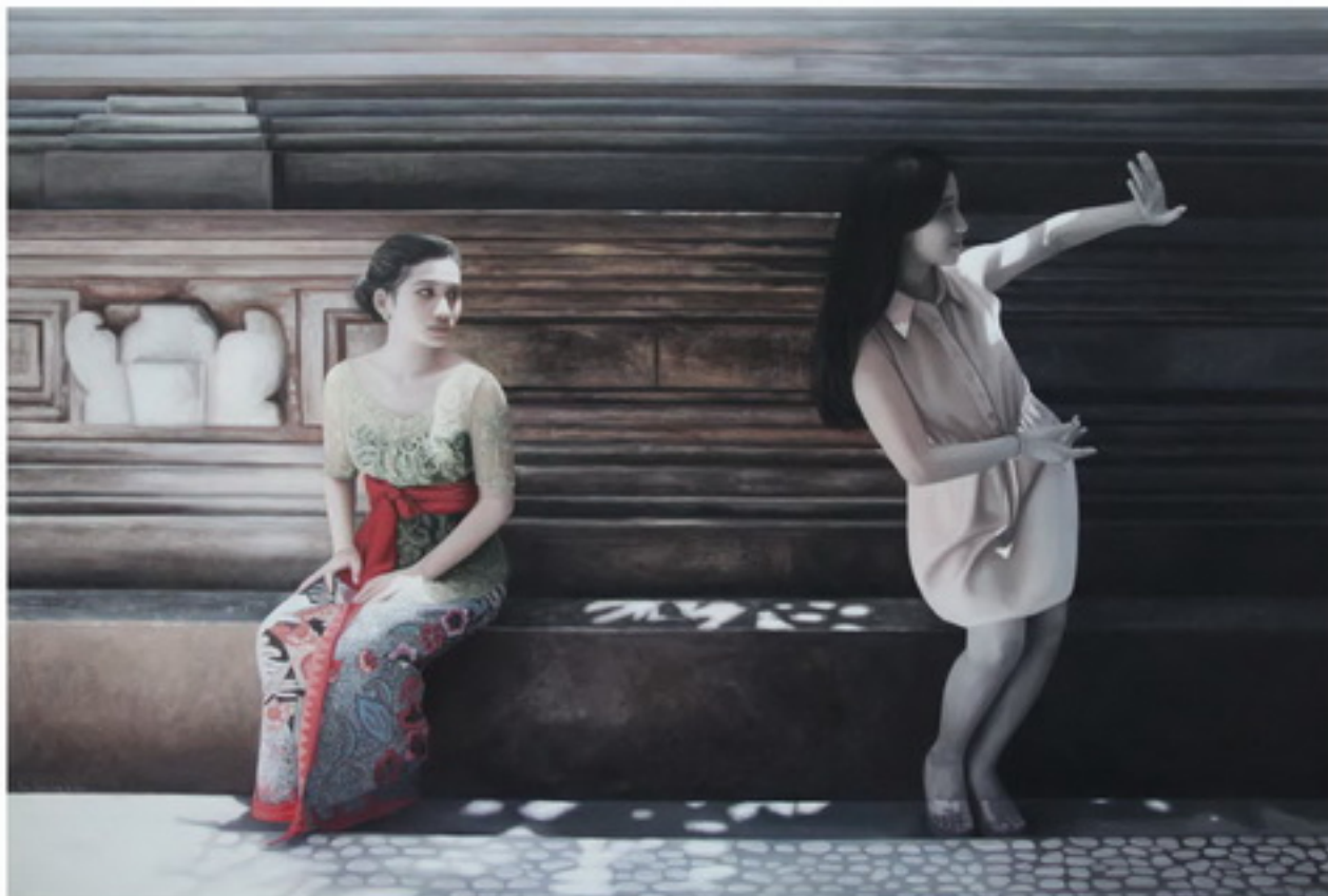
Reminisce 120 x 180 cm Oil on Canvas 2016