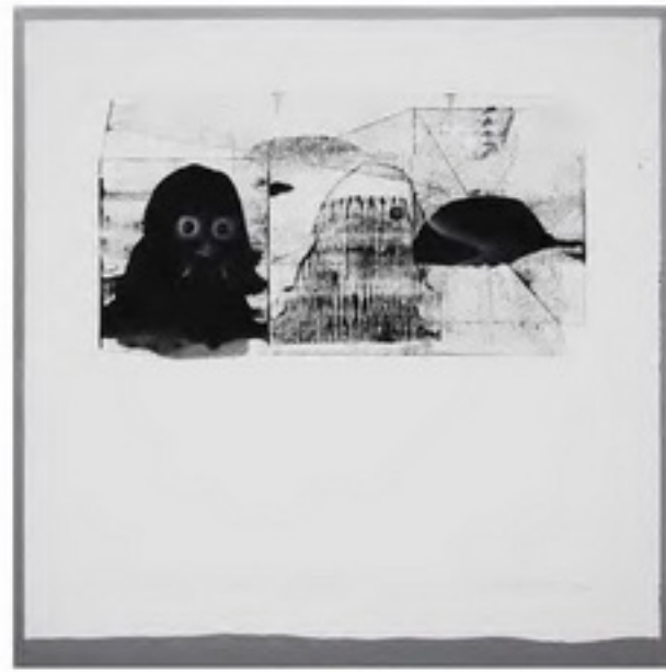
Campak ke Darat Jadi Gunung 61 x 61 cm Oil on Canvas 2016