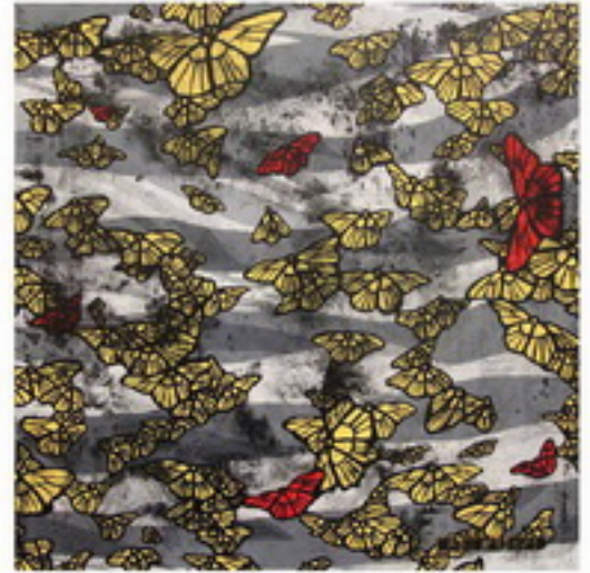
Respect Nation 61.5 x 61.5 cm Acrylic & Oil on Canvas 2016