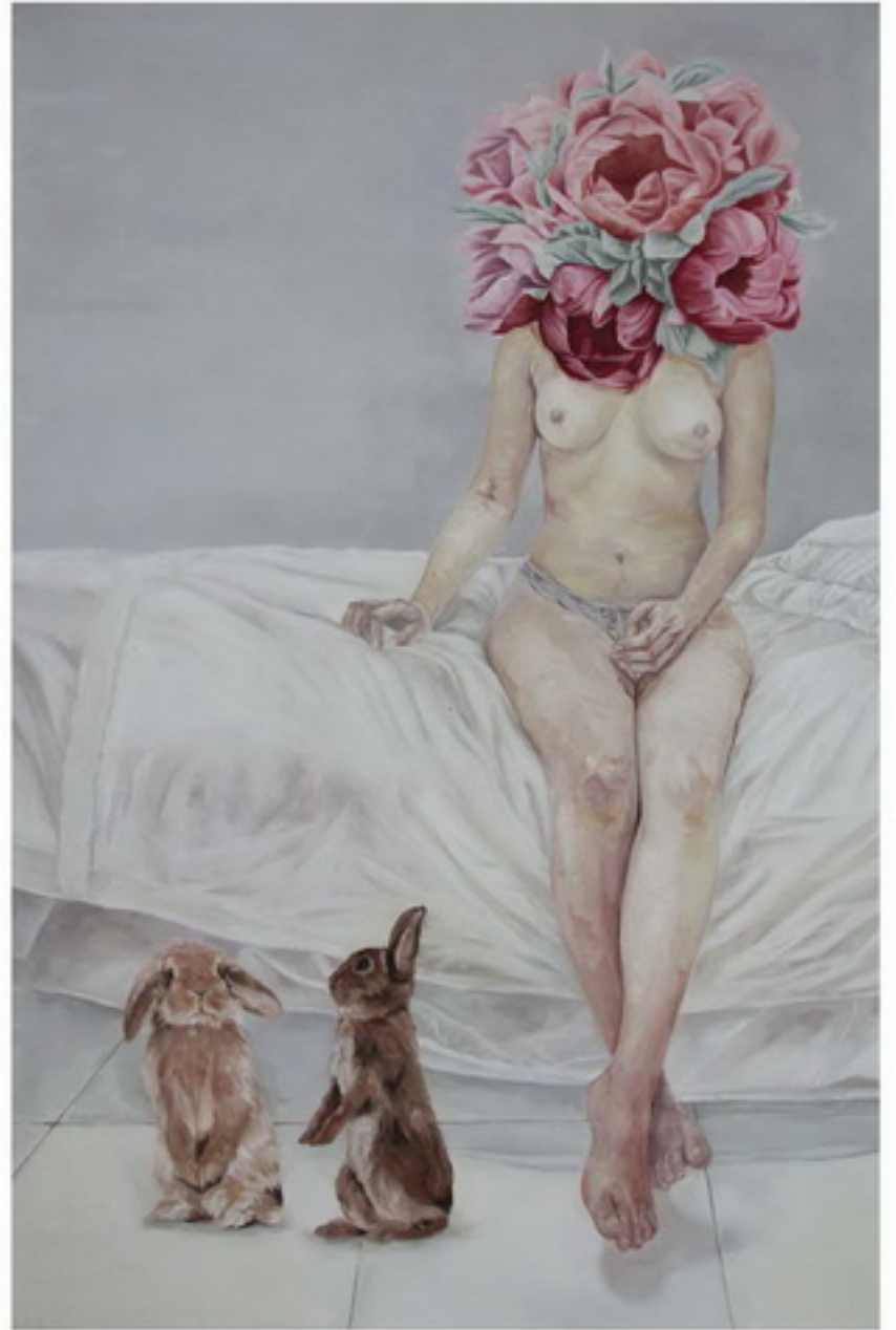
Peeping Rabbits 170 x 113 cm Oil on Canvas 2016