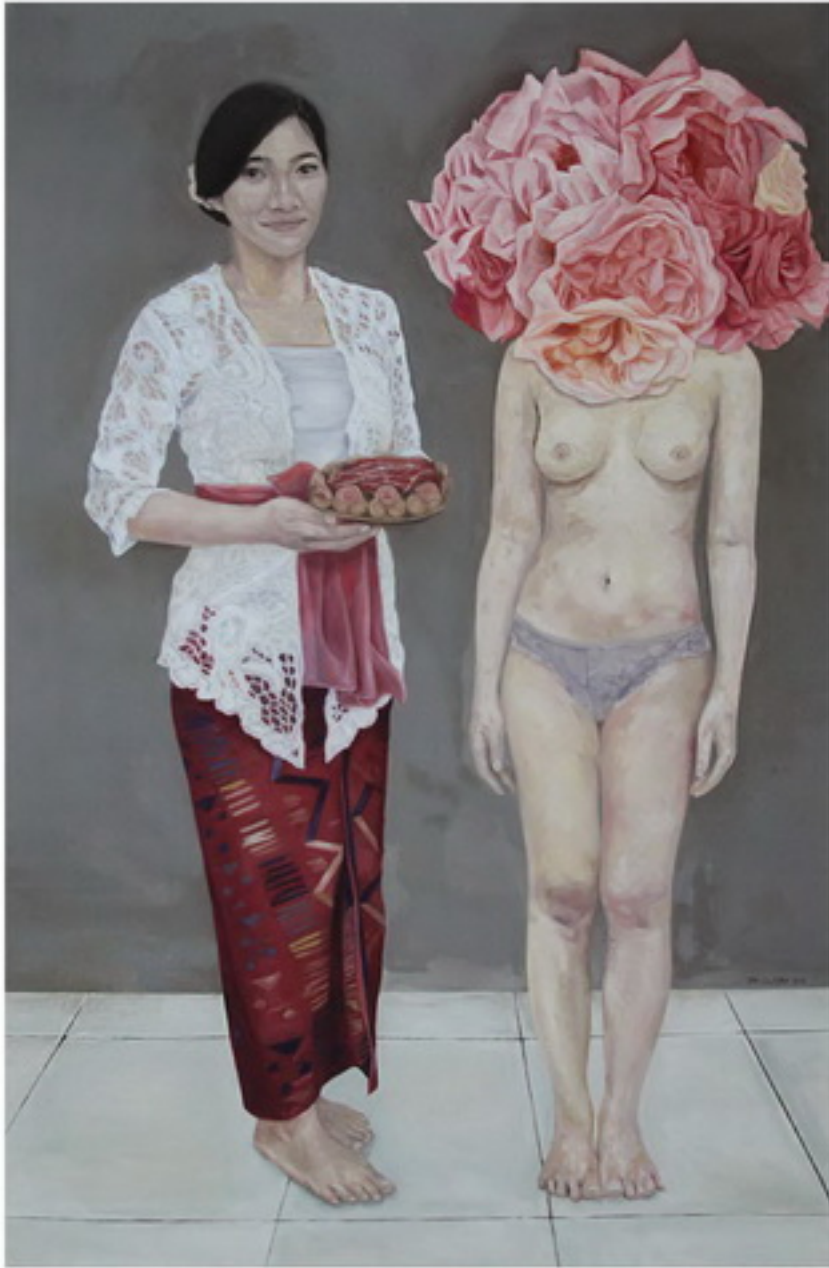
Now 170 x 113 cm Oil on Canvas 2016