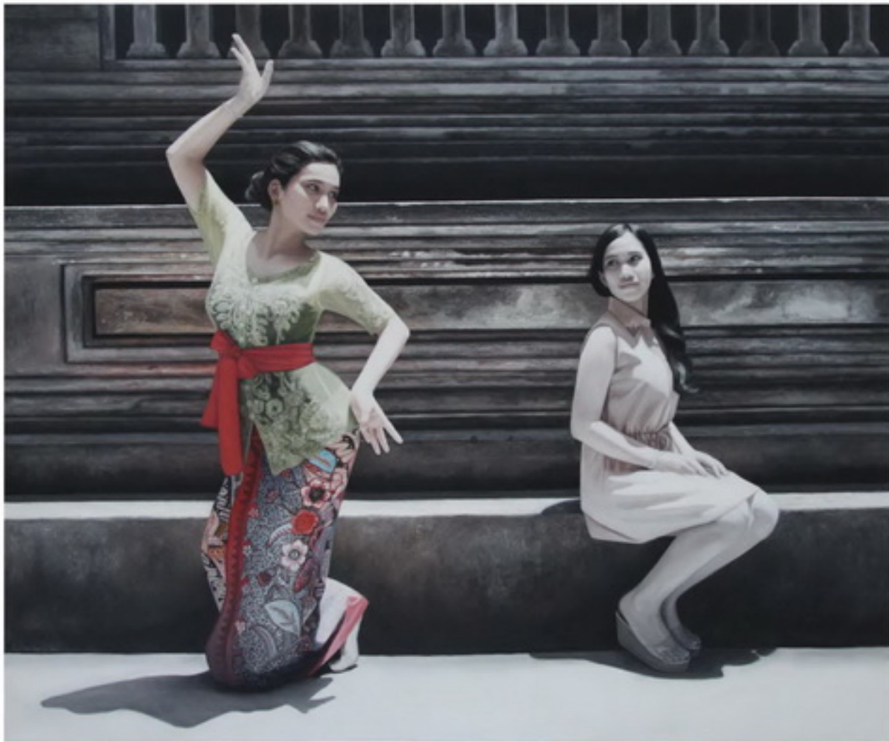
Nostalgia 130 x 160 cm Oil on Canvas 2016