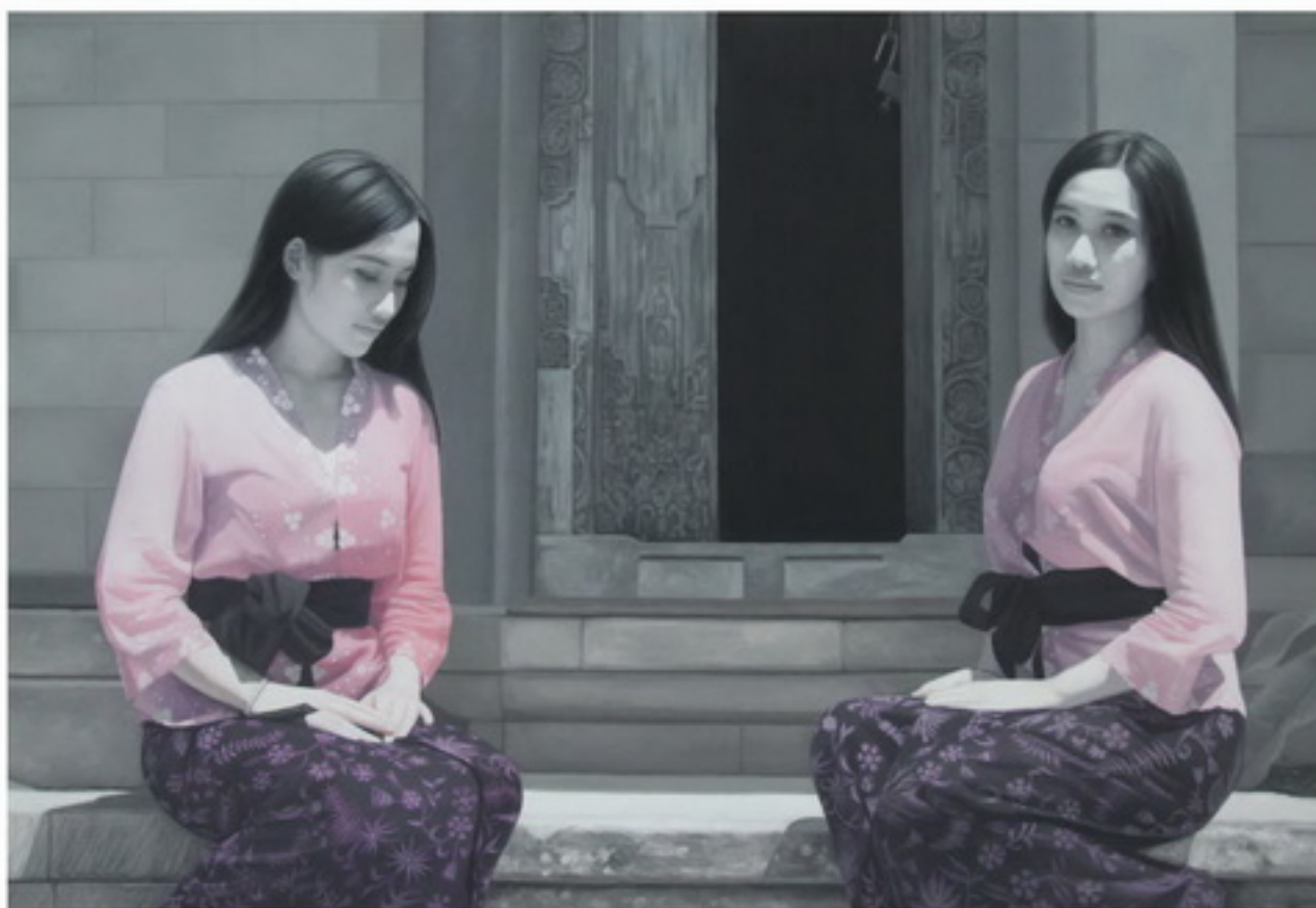
Contemplation 120 x 180 cm Oil on Canvas 2016