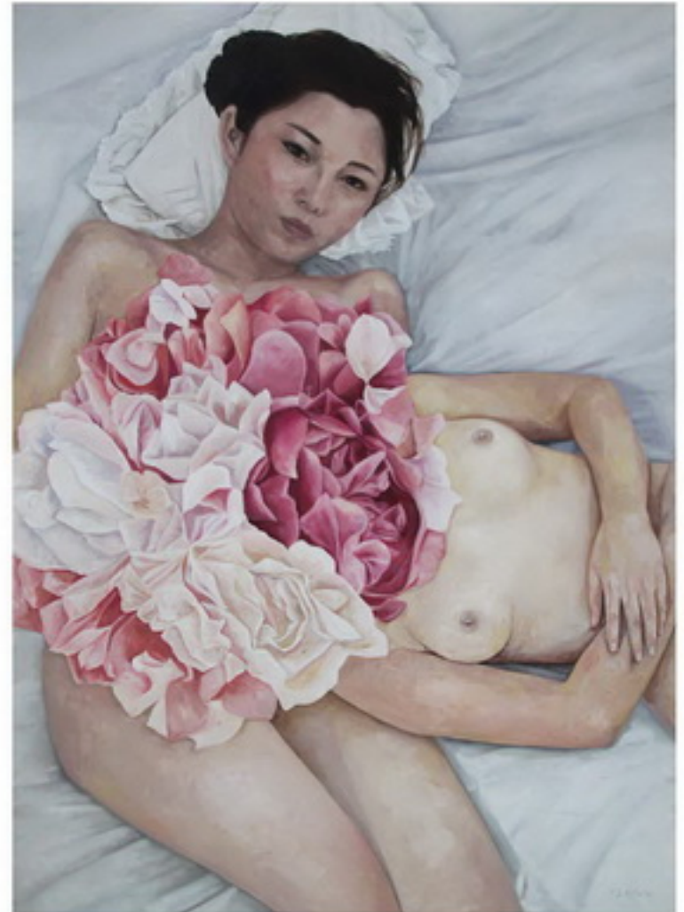
Twin 170 x 122 cm Oil on Canvas 2016