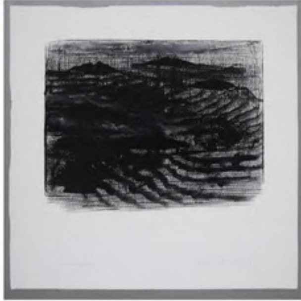
Tanah Lot Bali 61 x 61 cm Oil on Canvas 2016