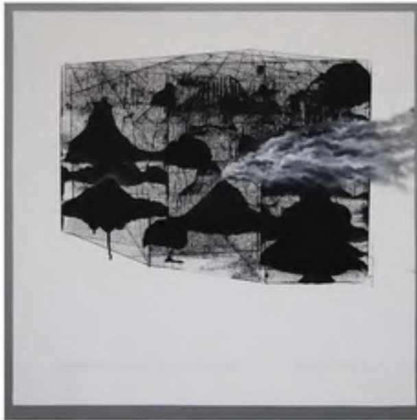
Bebek Dan Bayang Hitam 61 x 61 cm Oil on Canvas 2016